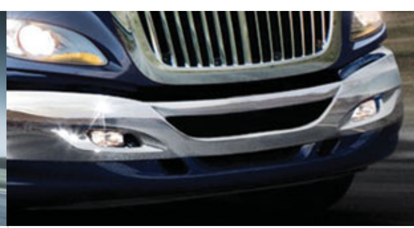
With its optional bumper seal, wraparound windshield, and patented day cab roof fairing, ProStar increases your efficiency by reducing air resistance