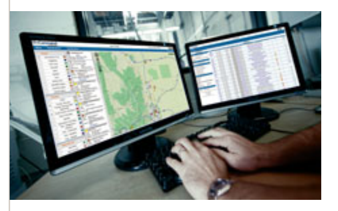
OnCommand Connection works with over a dozen telematics service providers to provide remote diagnostics