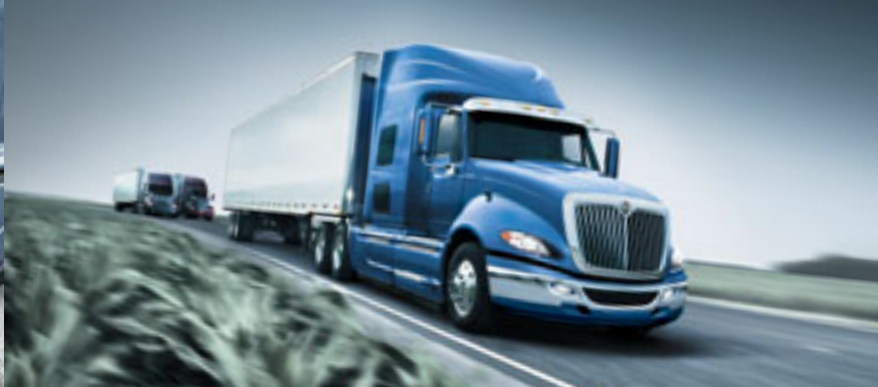
Better aerodynamics means better fuel economy